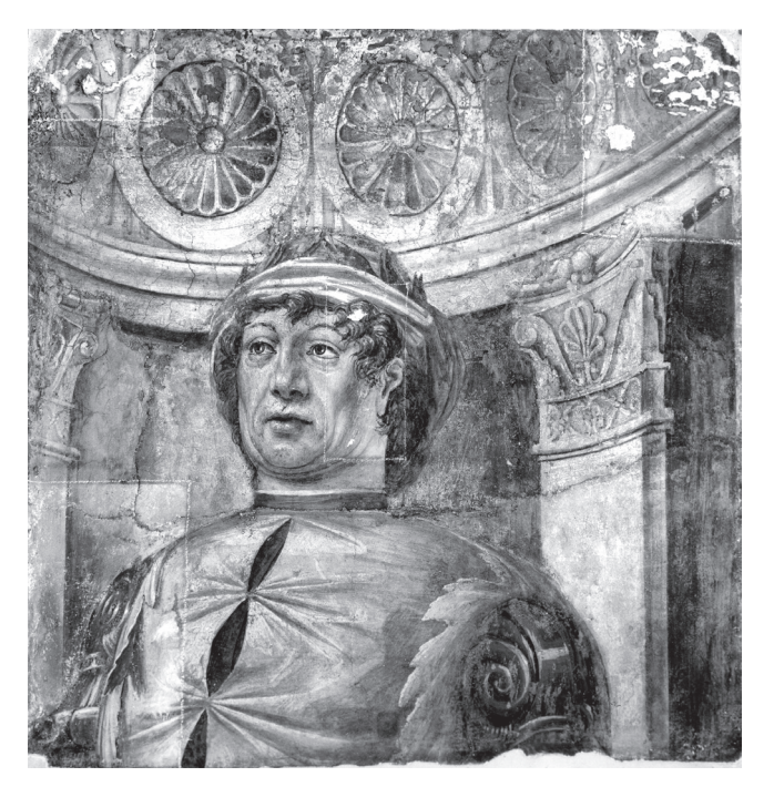
Figure 2 .- Poet laureate with red hat: historical photograph during Mrs. Brambilla's conservation treatment (1976).

After entering in Brera, other conservation treatment before 1976 are not documented but it is likely that more localized interventions have been conducted, mainly with an aesthetic purpose.