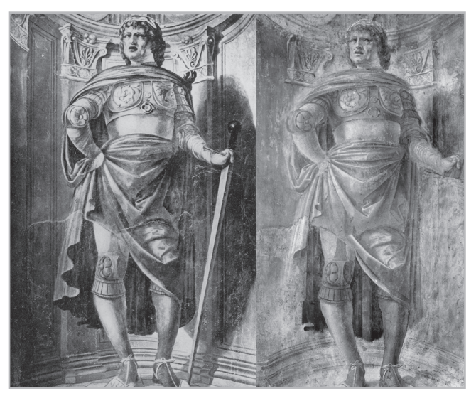
Figure 1 .- Man with a Two-Handed Sword: historical photographs before and after the 1901 treatment

The figures showed evident remakes, as proved by the photographic documentation available before the treatment of 1901, with particular reference to the Man with a Two-Handed Sword (the only figure still fully visible in the early twentieth century) and to the architectural backgrounds of the other half-length figures (Historical Archive of Pinacoteca di Brera) [Figure 1].