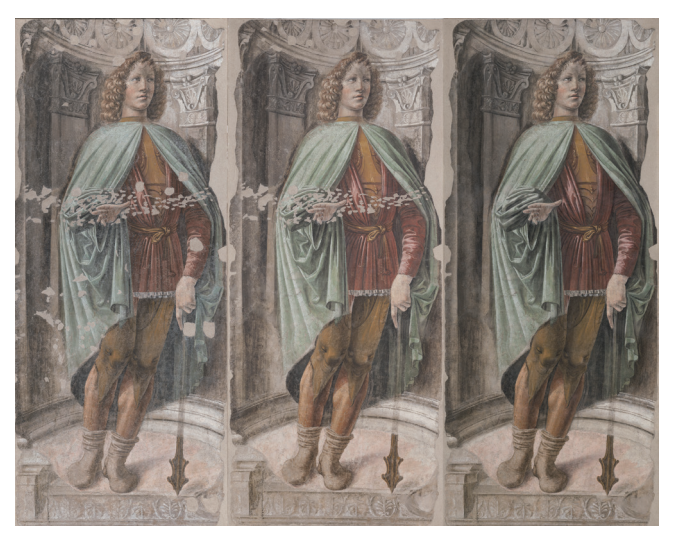
Figure 3 .- Man with the Mace: before, during and after the CCR conservation treatment.

In this working perspective, considering the pictorial cycle as a whole, an integration methodology was developed, able to adapt to the specific problems of each individual work, to guarantee a uniform result. For this reason the retouching has been developed during the work in two distinct phases: initially, only the lacunae by accidental damage were treated; only later those with the lack of color, such as hammering areas, due to voluntary actions that characterized the history of the artworks [Figure 3].