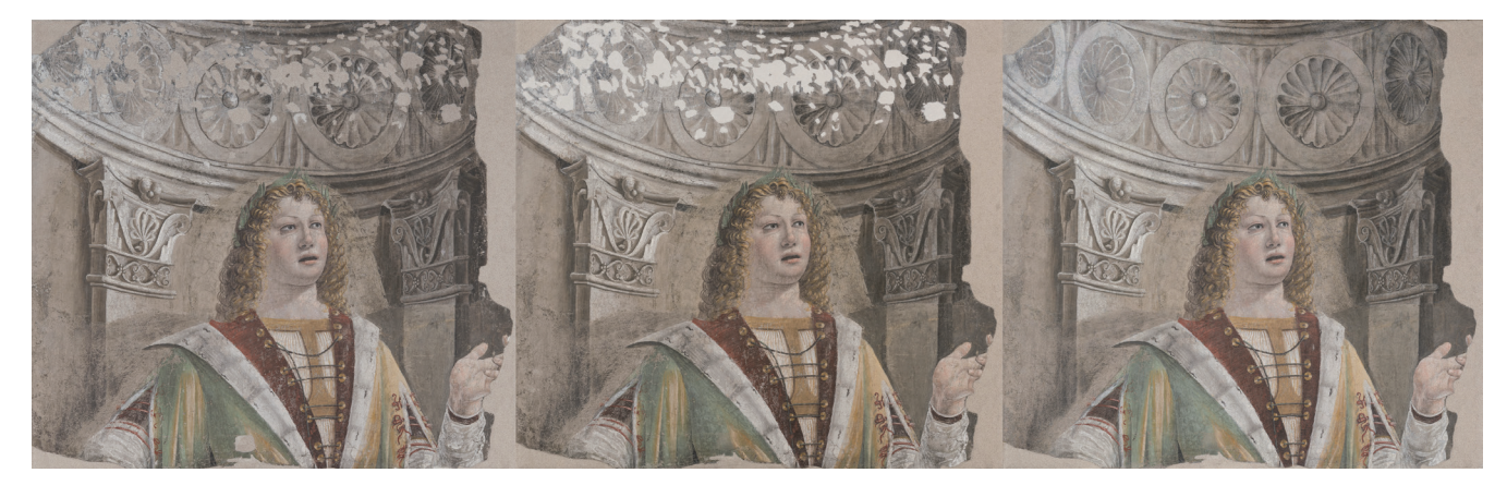
Figure 4 .- The Chantor: before, during and after the CCR retouching treatment.

In the paintings Heraclitus and Democritus and Man with a Halberd there were several areas with lacunae of only the pictorial film and intonaco on sight. In these cases, the stucco filling on the original finishing plaster was obviously not carried out, but the individual areas of color were reconnected with a semitransparent glaze. In the Man with a Halberd, moreover, following the removal of the previous retouches changed in tone, more extensive abrasions emerged, mainly in correspondence of the left eye. In this case, in continuity with the choices adopted during the previous treatment, it was decided to treat the areas with missing pictorial film with a mimetic retouching: this in order not to alter a fundamental portion of the figure and not to compromise the perception of an image that has already settled in the collective memory [Figure 6].