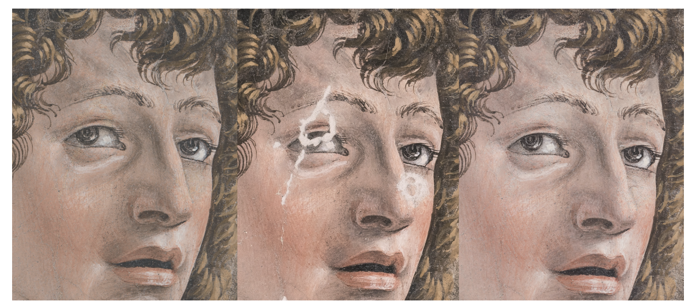
Figure 6.- Man with Halberd: detail of the face before, during and after the CCR conservation treatment.