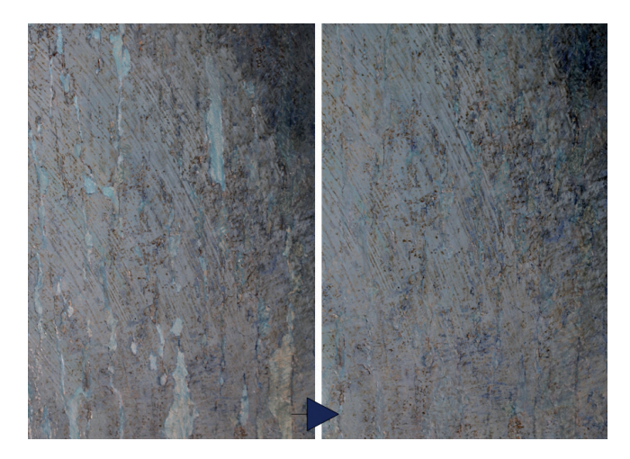
Figure 5. - The inpainting process: from gouache to pigments with Canada balsam. ©Sučević Miklin

This kind of inpainting was also performed earlier in 2016 on another Babić's work – the "Clouds". The "Clouds" is a painting similar to the "Black flag" in terms of support, ground layer and painting, including lots of visible brushstrokes and not completely mixed paint on a small surface. Using the method of mimetic inpainting and two types of media,