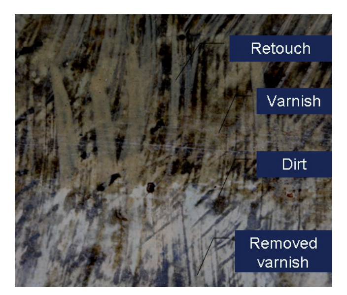
Figure 2.- Yellowed varnish, dirt and retouch layers. Area with removed varnish.

Fourier-transform Infrared Spectroscopy (FTIR) has shown that the preparatory layer consists of calcium carbonate but the binder could not be precisely identified. The ground was applied with a brush in a thick layer, with an uneven application and not completely sanded to form a smooth and levelled surface.