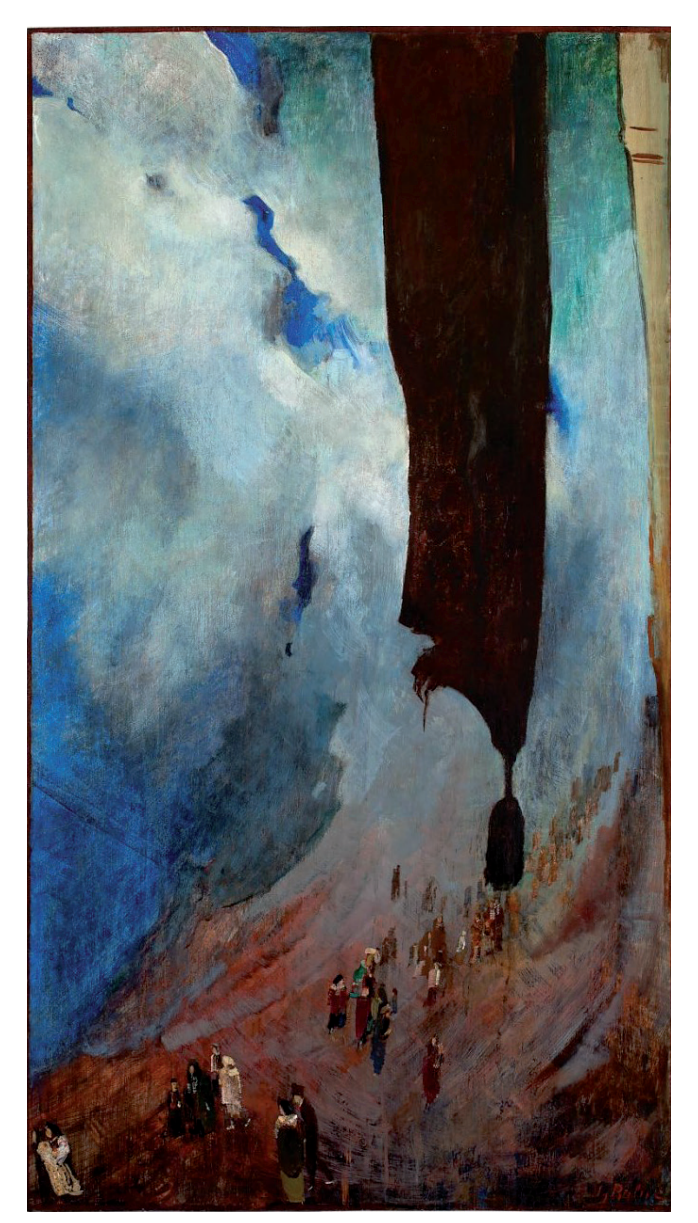
Figure 6.- The "Black Flag" after restoration.

The inpainting method presented by Stefano Scarpelli includes the first step of the retouching in gouache, then the first application of varnish, the second stage with glaze paint and the final varnish. The first varnish layer applied after the gouache serves to enhance the gouache paint (gouache colours tend to lighten after drying), to protect it from removing and also serve as a barrier for the upper layers that could affect the lustre differently on the original paint and on the retouches in gouache. Then, comes the inpainting with glaze paint and the final varnish, that adjusts the surface lustre of the painting.