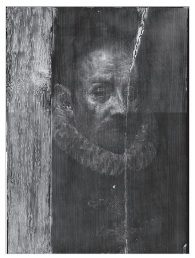
Figure 3. - Adriaen Thomasz. Key, Portrait of William of Orange, X-radiography