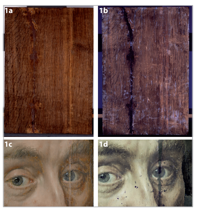
Figure 2. - Adriaen Thomasz. Key, Portrait of William of Orange, before treatment; location old splits and joins showing the filling material. 2b Reverse in Ultraviolet fluorescence, the filling appears dark. 2c Detail of the eyes showing the soft modeling of the face. The split in the panel is filled. The face is generally well preserved. The blue arrows indicate retouching that could not be removed. 2d Same detail as 3c in ultraviolet radiation

The x-radiograph of the painting shows that the narrow, left plank deviates from the main part of the painting in that it shows the presence of much heavy elements [Figure 3]. This