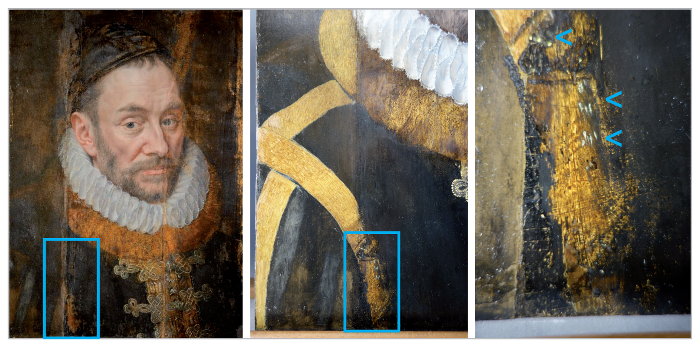
Figure 5.- 5a-c Left shows the painting during retouching with plain modulated colours. The tiny details for the embroidered decoration are more easily visible now

while the non-original addition on the left has a ground layer containing lead white and yellow earth (XRF: Pb, Fe). This difference explains why the addition appears bright white on the X-radiograph, while the original part of the panel is relatively dark. The composition of the ground and paint used on the left plank are idiosyncratic for the 16th century, and indicate it was definitely added later. The replacement of the additional plank on the left was of high quality: the oak was a good match, and alignment quite well with the original panel. Therefore, the decision was made to leave the non-original plank in place, but to thin the paint layers. Unfortunately, there are not enough year rings to perform dendrochronology of added plank.