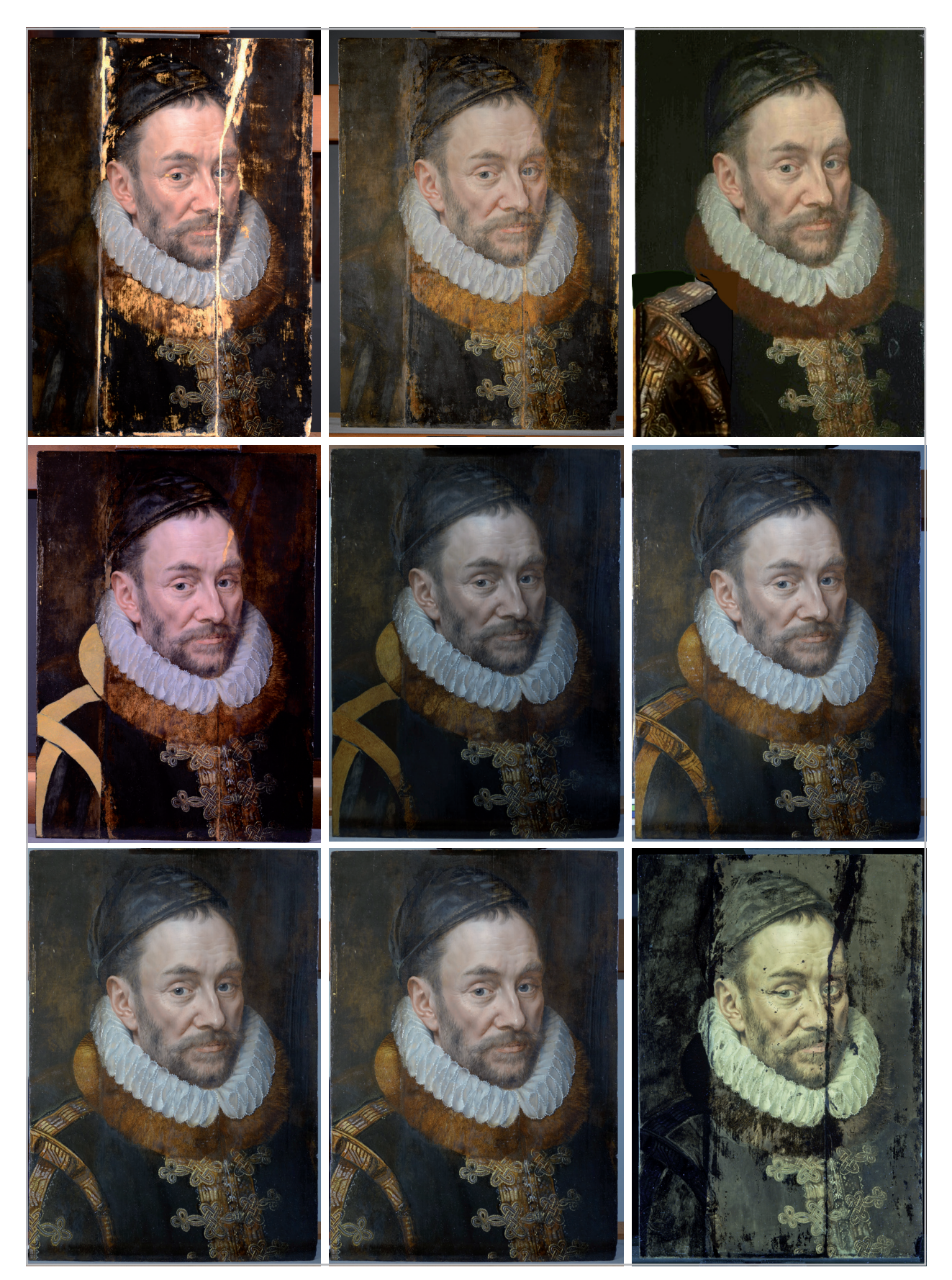
Figure 6 .- 6a Painting after retouching with watercolour to create a similar colour in all the losses. 6b Left shows the painting during retouching with plain modulated colours. 6c Painting before treatment with shoulder decoration from the Thyssen version in the left bottom corner. 6d Beige base-tone with gouache. 6e Gouache is coloured with brownish scumble. 6f Dark details applied to break up form. 6g Discreet amount of details to imitate embroidery. 6h Painting after treatment. 6i Ultraviolet image of painting after treatment. De dark areas show the applied retouchings