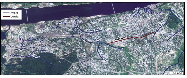
Figure 4. - Bodies of water in Perm filled or enclosed in underground sewer.

of them were backfilled or enclosed in underground drainpipes. Mapping their channels would eliminate the technical excesses even at the design stage of buildings and constructions [Figure 4]. Integration archival maps and modern topographic proved useful for fixed changing coastline of the Kama and the location of the oxbow lakes in boundaries of Usolie by reason of channel processes before commissioning of the Kama hydroelectric station. Drawing of water and transport networks, communication networks, which appeared at the turn of the 19-20th centuries on the relief, demonstrates conditionality of their historical location. Finally, by means the archival cartographic sources are integrated to the modern topographic were refined construction periods, historical functions of many monuments of industrial architecture, including those from which only the foundations remain. Thus, the analysis plans of Perm and Usolie with application