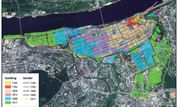
Figure 2. - Map of administrative boundary and quarterly network development in Perm. This figure was first published in 5th International Conference Youth in Conservation of Cultural Heritage YOCOCU 2016 Congress Book, published in relation of the conference YOCOCU 2016, organized by Museo Reina Sofía's Department of Conservation-Restoration, Fundación Museo Reina Sofía, YOCOCU (YOuth in COnservation of Cultural Heritage) Association and the Institute of Geosciences (CSIC-UCM), which took place from September 21th to 23th, 2016.