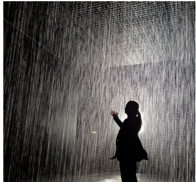
Figure 1.- Rain Room by Random International, 2013.

The works of art today are created by a design and the artist does not make the work, it has been created based on a design that was generated by a software, the artist only decide how this should be done.