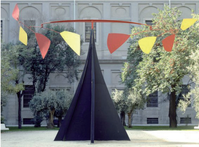
Figure 3.- Carmen by Alexander Calder. MNCARS.

perception of them. Such as the work Carmen , placed at Museo Nacional Reina Sofia, or others works, like the one in National Gallery of Art, Washington, D.C. in both cases the works were restored replacing the original paint by a new layer of paint [figure 3].