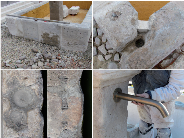
Figure 5.- Restoration details: substituting cement for limestone and pylon waterproofing; discovery of the primitive spillway corner; conservation and protection of the original remains; new sewers made of brass as per the primal design.

This is the case of the Four Sewers Fountain in Daganzo. The use of this new products has led to unfortunate consequences in the fountain preservation: first of all, Portland mortar is less porous, less elastic, harder, has a different thermal and mechanic behaviors; besides the high content of soluble salts that may crystallize in the stone material. Therefore, it was necessary to remove it all and substitute by lime mortars.