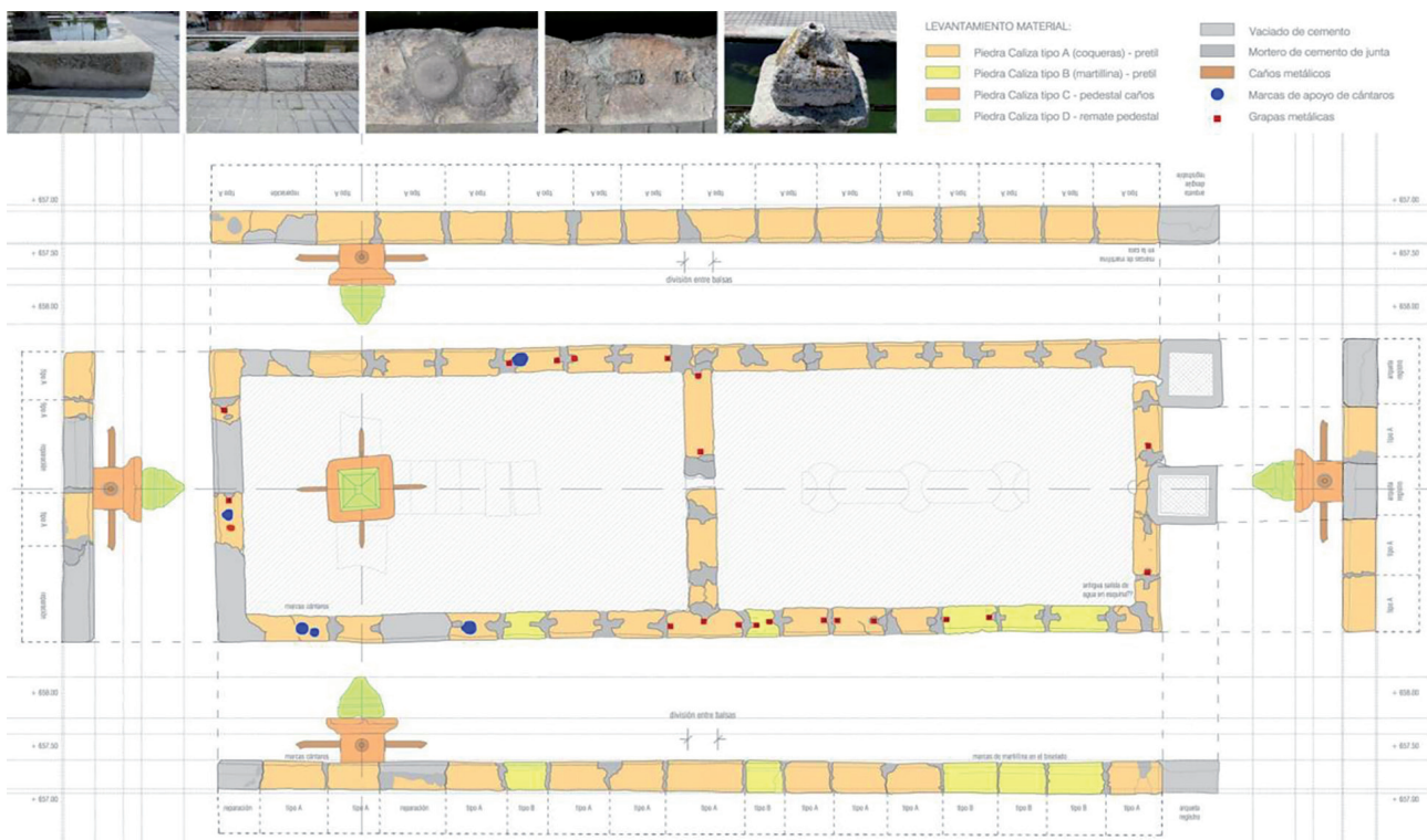
Figure 1.- Constructive analysis of the initial stage of the fountain (2013).

This part describes the stage of the fountain and its immediate surroundings prior to the restoration labours [figure 1].