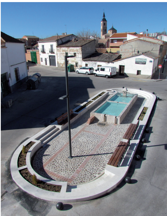
Figure 6.- image of the intervention in the Fountain Square (2015).

Lastly, in order to bring the intervention close to citizens, an exhibition entitled "Fuentes de Daganzo, aguas con historia" was prepared by the architect V. García, the Daganzo City Council and the Daganzo Municipal Archive for dissemination purposes and in collaboration with the Community of Madrid, in the Culture House of Daganzo from the 4 th to the 28 th of February 2015.