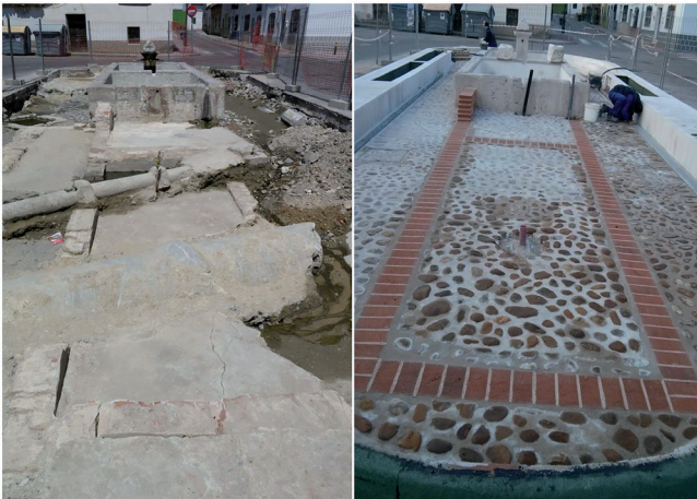
Figure 2.- Comparison between the archaeological excavation and the final restoration.

The archaeological excavation resulted into the discovering of important remnants of the old laundry brick construction, together with the original cobblestone boulder set around the pylon and the original slab foundation, made of stone (Mendoza 2014). So, team proceeded to study, document and integrate it in the restoration project [figure 2].